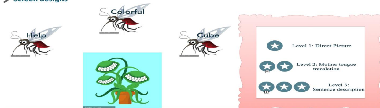
Fig. 2. Main Screen designs

In the Session two of “story making,” learners can unlock different characters using the accumulate points. The characters will act it out the sentence and story you make. Considering various social and emotional needs, the characters are not limited to insects, but also zoo animals, toy and even cartoon characters. Kids have self initiative to choose what they like. Once they choose their favorite character, they will go to the sentence making and story making page.