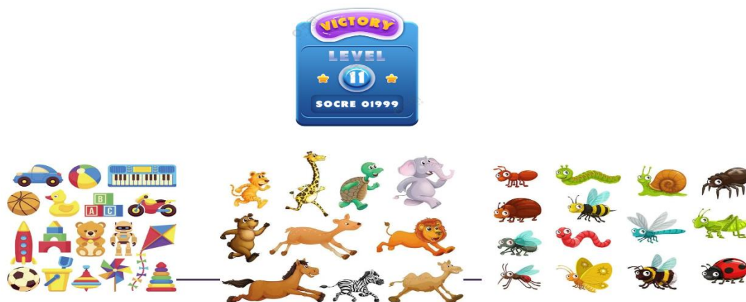
Fig. 1 Main Screen designs

Level 1 — direct picture will be given as easy clue to show the word meaning, and then students need to click the right mosquito, if they pick the right one, then the flytrap will eat it otherwise mosquito still be there. If they choose the wrong one, the existence of mosquito gives learners direct feedback or clue to help them rethink about the solution or answers.