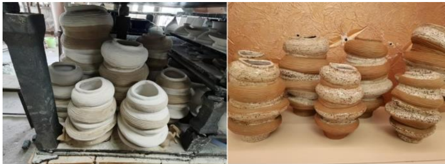
Fig 8. Firing in the Kiln + After Firing.

Step 6: The kiln-fired result demonstrates the rich variations of iron flakes that enhance the three-dimensionality of the piece. The decorative effect achieved is consistent with the desired result and effectively highlights the wind erosion's simplicity and dynamism. The shape of the work skillfully captures the essence of the wind's movement, while the irregular glaze variations interpret the subtle fluctuations of the wind (Fig 8).