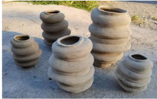
Fig 4. Stripping.

Step 3: During the glaze selection phase, the glaze chosen style is paramount. Three glazes, "Sunset Yellow Sand", "Pottery Black Dot Leopard White", and "Sand Basin White Dot" were meticulously considered and evaluated in order to emphasize the appearance of wind-etched mottling and the signs of the passage of time (Fig 5). White and black cosmetic clays were also explored as secondary options.