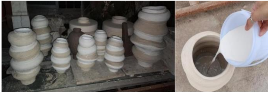
Fig 7. Glazing.

Step 6: The kiln-fired result demonstrates the rich variations of iron flakes that enhance the three-dimensionality of the piece. The decorative effect achieved is consistent with the desired result and effectively highlights the wind erosion's simplicity and dynamism. The shape of the work skillfully captures the essence of the wind's movement, while the irregular glaze variations interpret the subtle fluctuations of the wind (Fig 8).