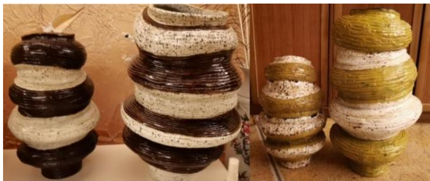
Fig 9. Brushing Raw Paint + Leach Line.

Step 7: The subsequent stage is the application of Lacquer, which is baked at a temperature of 150°C for 50 minutes to form a strong adhesion between the Lacquer and the surface of the pottery, laying the foundation for the subsequent decoration and painting (Fig 9). To emphasize the core features of wind erosion, a mixture of black Lacquer and fine tile ash was used and applied using the leached-line wrinkle technique. This was done to create the impression of wind over the hills and to reflect the granular texture inherent in wind-eroded landforms, creating patterns, textures, and finishes that emphasize the strengths of both materials.