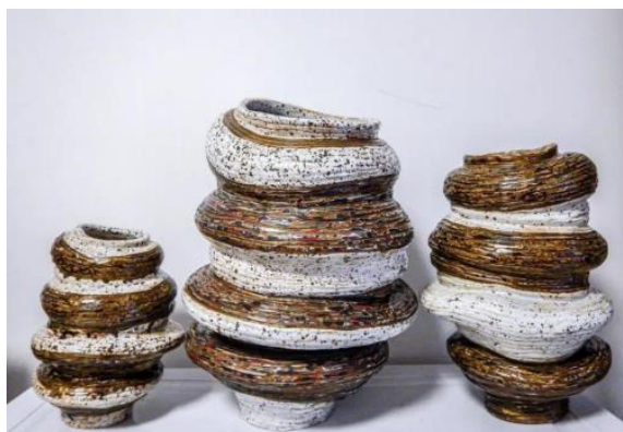
Fig 11. The Melody of the Work Wind Erosion.

The primary purpose of this creation was to show the grandeur and complexity of the Northwest Danxia landscape. However, the initial firing results did not meet the expected standards. Subsequent glaze polishing and secondary firings were intended to enhance glaze texture and color integration, but challenges remained. These obstacles led to exploring unconventional firing techniques, resulting in unique textures that add a distinctive flavor to the piece. A strategic design approach was born in response to the problems encountered during the two small-scale firings. Integrating multiple mountainous sections on either side of the piece was one solution. Utilizing the power of Lacquer, an intricate pattern resembling rhinoceros' skin was etched into the surface of the ceramic using black, red, and gold colors. This method not only solves the problem of imperfections but also breaks the uniformity of the mixed glaze colors and introduces a dynamic visual element. The harmonious interaction between the Lacquer's brightness and the ceramic's tactility became a central achievement. These techniques pushed the boundaries of traditional craftsmanship and created a coherent unity between Lacquer and glaze. Although the color textures are similar, subtle variations emerge, highlighting the combination of shapes and tones. An iterative approach to refinement and innovation remains integral, facilitating the exploration of new techniques, materials, and cultural elements (Fig 11).