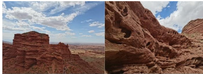
Fig 1. The landscape of Yadan.

the terrain by wind erosion, a design conception was born that perfects the undulating and interlocking lines. These design elements are reminiscent of the wind-eroded landforms, subtly capturing the impact of the elements that shaped them.