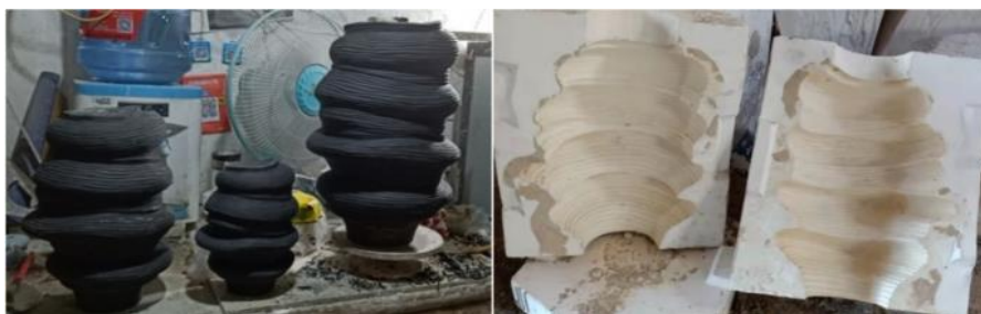
Fig 3. Mold Forming.

Step 1: Before fabricating the unglazed pottery, a thorough evaluation of various molding techniques was conducted, considering multiple objective variables. After determining the potential risks associated with high-temperature firing, a pragmatic method, mold molding, was used because of its convenience and minimal risk (Fig 3).