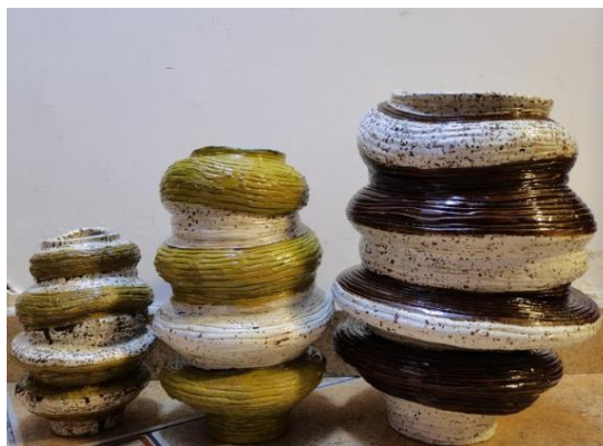
Fig 10. Before Sanding in Different Colors.