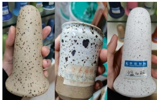
Fig 5. Three Glazes.

Step 3: During the glaze selection phase, the glaze chosen style is paramount. Three glazes, "Sunset Yellow Sand", "Pottery Black Dot Leopard White", and "Sand Basin White Dot" were meticulously considered and evaluated in order to emphasize the appearance of wind-etched mottling and the signs of the passage of time (Fig 5). White and black cosmetic clays were also explored as secondary options.