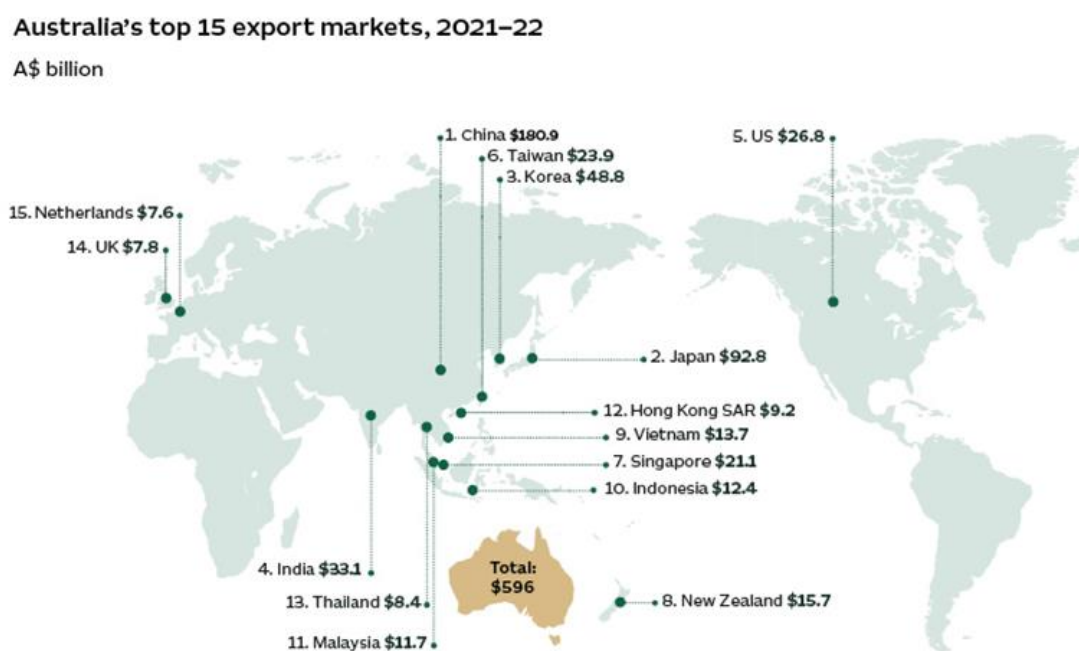
Fig. 2 Australia's top 15 export markets, 2021-22 [11]