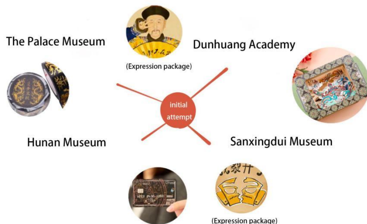
Figure 1. Domestic museums' attempts at cultural and creative industries

export its culture with food topics. The Dunhuang Research Institute has three sub-brands, which focus on interpreting Dunhuang art, cooperating with external brand and organizing public events. A new model for the development of cultural and creative products in the network era has been formed.