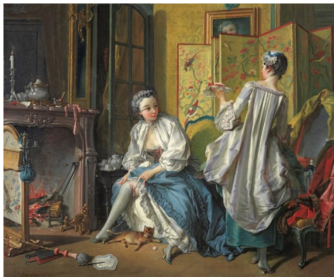
Fig. 3 Francois Boucher, La Toilette dit aussi Femme nouant sa jarretière , 1742, Museo Nacional Thyssen-Bornemisza, Madrid

into his works, Boucher started to imagine and create scenes of everyday Chinese life that included more Eastern themes. Boucher is known for his Chinese-themed paintings, one of which is The Chinese Garden (Fig.5). The painting's blue and white hues are reminiscent of porcelain, one of China's most recognizable products of the period. The Chinese elements are the coloring and the indoor plants—such as the bamboo, the round fan, and the porcelain vase. The theme of all these paintings seems to be something happening in the Chinese garden; perhaps it's a quick glimpse of the concubine lounging in the park on a sunny afternoon.