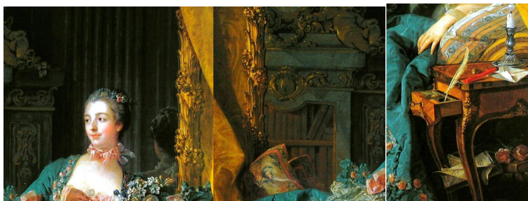
Fig. 2 Details of the painting: Francois Boucher, Madame de Pompadour , 1756, Alte Pinakothek, Munich, Germany