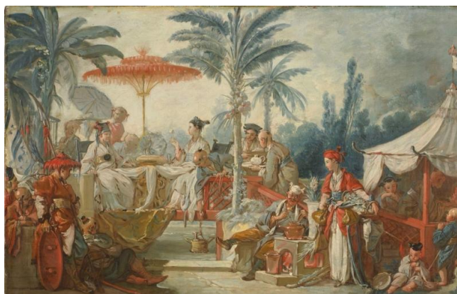
Fig. 6 Francois Boucher, The Meal of the Emperor of China , 1742, The Museum of Fine Arts and Archeology of Besançon, Besançon

Furthermore, Boucher has never traveled to China in his entire life. He perhaps drawing inspiration from Marco Polo's book or stories from travelers or merchants who had already visited China, or from the prints which imported from the Suzhou city in China [8]. Upon closer inspection, the behavior shown in the painting resembled that of French nobility more than anything else, resembling a high tea at the Palace of Versailles, save for a few missing artifacts. Going back to Boucher's painting, this assertion suggests that it would be more acceptable to interpret it as a scene of French aristocracy in an Oriental-style Garden, surrounded by individuals with faces reminiscent of the Orient. This kind of fusion denotes the combination of Chinese and Rococo features to create the name "Chinoiserie."