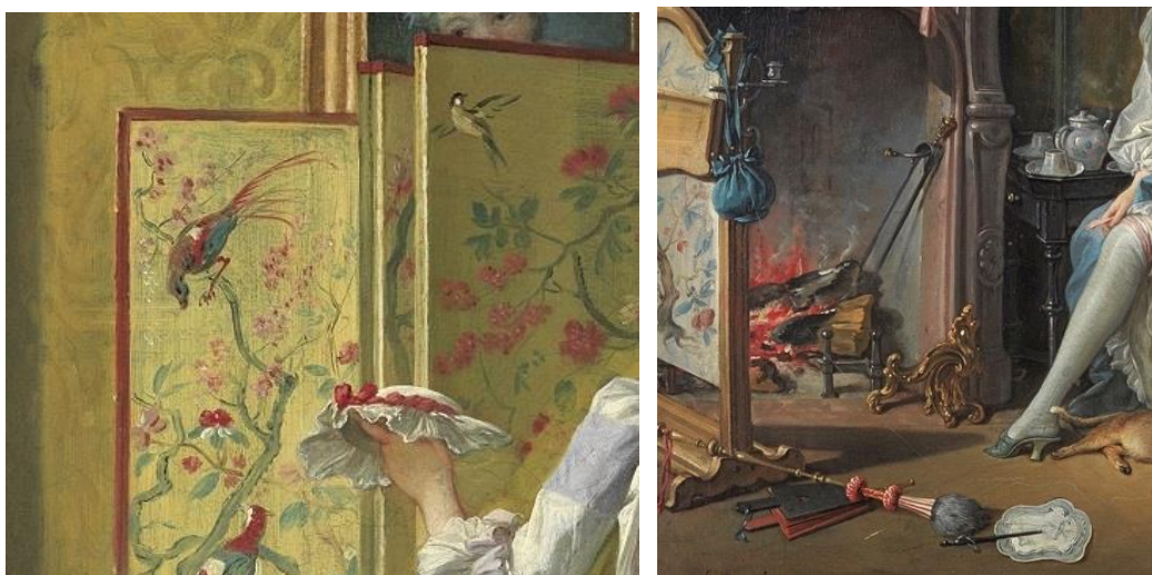
Fig. 4 Deatils of the painting: Francois Boucher, La Toilette dit aussi Femme nouant sa jarretière , 1742, Museo Nacional Thyssen-Bornemisza, Madrid