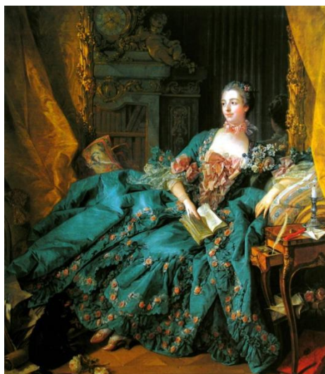
Fig. 1 Francois boucher, Madame de Pompadour , 1756, Alte Pinakothek, Munich, Germany

contrasts sharply with the dominant high society of the Bouchée era. The influence of Madame Pompadour is responsible for her unique aesthetic approach. Both Madame Pompadour and Boucher were significant individuals in eighteenth-century France, influencing the day's fashion trends. Chinese dress at this time piqued Boucher's interest since it evoked wonder and excitement in Europeans with a mysterious quality. Boucher's production of a sequence of paintings portraying ancient China in the late 1700s was probably inspired by this curiosity.