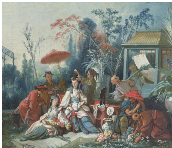
Fig. 5 Francois Boucher, The Chinese Garden , 1720-1770, The Museum of Fine Arts and Archeology of Besançon, Besançon