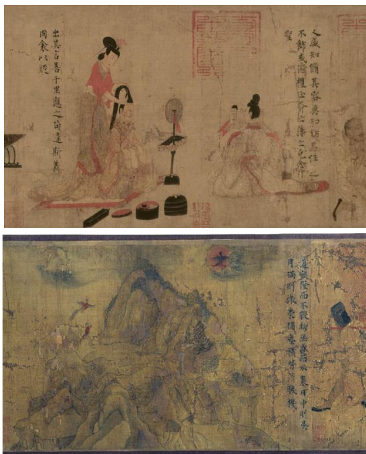
Fig. 2 Book of Mermaid [11]

The “Book of Mermaid” (Painting of a Woman’s History) is another masterpiece by Gu Kaizhi, but now the original painting has been lost, leaving only a copy from the Tang Dynasty. It, by recounting the deeds of prominent women in history, serves to educate the morals of women in the upper class during the Wei and Jin dynasties. As a serious painting with a didactic nature, it still contains many scenes of life, such as dressing, talking, arguing, writing, music, and so on (Figure 2). The painting also features a mountain with a variety of animals and a hunter with a crossbow ready to kill a tiger on the mountain (Figure 2). This work fully demonstrates that the art aesthetics of the upper class in the Wei and Jin dynasties tended to be "living", and natural elements were gradually used as the background of the paintings, as an articulated part, or even as an important part of the works.