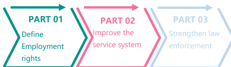
Figure 2. Measures to Promote Employment Equity

The employment issues of people with disabilities continue to receive significant attention in current society. Despite societal progress, people with disabilities still face many challenges and difficulties in the job market. Establishing a comprehensive employment policy system for people with disabilities is crucial, as illustrated in Figure 2. First, defining the rights and protective measures for the employment of people with disabilities is fundamental. As members of society, they have equal employment rights, which must be effectively protected. Specific measures such as employment subsidies and tax incentives should also be introduced to encourage businesses to actively employ people with disabilities. Second, strengthening the construction of a disability employment service system is key. Comprehensive employment services should be provided, including job guidance and vocational training, to help disabled individuals enhance their employability and competitiveness. This can improve their employment rate and better integrate them into society, realizing their self-worth. Third, enhancing law enforcement to combat employment discrimination is essential [7-8] . A robust complaint and reporting mechanism should be established to seriously address violations of disability employment policies by businesses and individuals, ensuring the protection of employment rights for people with disabilities.