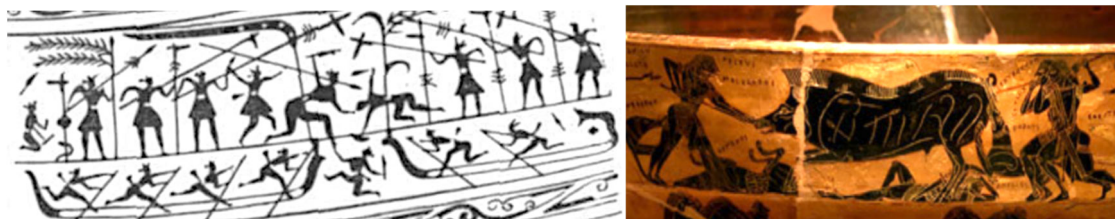
Fig. 3 Water battle on the Warring States Feast and War Pictorial Bronze Vessel(left) [5] and the hunt in Calydonon the Francois Vase(right) [15]

pottery-Eastern Zhou pursued the enjoyment in the expression of the inner essence, while ancient Greece pursued rationality in realism.