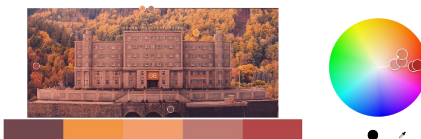
Figure 2. Natural colors harmony

Secondly, it refers to the natural or familiar color scheme that will form harmony (naturalness or closeness). The exterior scene of the hotel in the 1960s on the third floor of the film adopts Wes Anderson's iconic axisymmetric composition (Fig. 2), Brown tone accords with people's subconscious experience of the main color tone of autumn in nature. Cut shots directly from the pink, cake-like hotel to the brown, naked hotel with its sugar-coated shell falling off. It intuitively shows a sense of gap after the collision between dreams and reality, which is a metaphor for the decline of civilization.