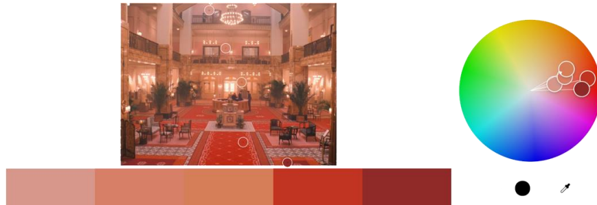
Figure 3. Similar colors harmony

of color harmonization in this film, which effectively matches the change in plot tone. The interior of the hotel at the end (Fig. 3) creates a transition from pink to yellow to bright red from top to bottom. After taking the color you can find that the maximum angle between the color and the line connecting the center of the color wheel is about 30 degrees, which constitutes a similar color taking.