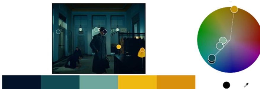
Figure 4. Contrast color harmony

Finally, Moon and Spencer divided colors into harmonious areas and disharmonious areas (ambiguous areas) and believed that the combination of "clear" colors in the harmonious areas were harmonious. However, color contrasts can be composed by rendering large areas of primary colors and dabbing small areas of complementary colors to increase clarity when mixing colors. Take the plot of a lawyer being killed as an example (Fig. 4), the director uses a gradient cyan with decreasing brightness difference to render the main color and form a harmonic area. In addition, the director set up several high-purity yellow lights to form a green-yellow contrast. In addition, the overlap of gradient cyan forms a perspective effect, which increases the layering of the picture, increases the three-dimensional movement of the picture while ensuring the balance of composition, and also indicates the plot turning point (the lawyer is about to be assassinated) [2].