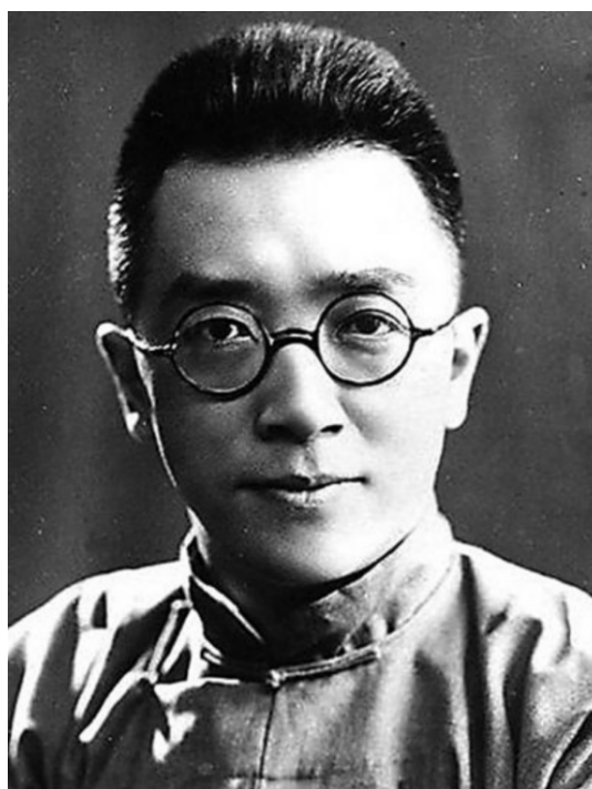
Figure 2. Hu Shi

The connotation of Hu Shi's academic thought lies in the comprehensive application of scholarship spirit and scholarship method, taking the right choice of study future and major as the appropriate entry point for scholarship, and inheriting and conserving the basic scholarship spirit. Hu Shi highly agrees with the importance of freedom of thought, and believes that without freedom of thought, there is no real thought, or without freedom of thought, only destructive thoughts can be produced: flattering thoughts or complaining thoughts. The construction of society depends on academic progress, and academic progress requires the atmosphere of freedom of thought to make scholars hold individual thoughts [9]. There is always a standard for the quality of poetry, which is nothing more than sentences and emotions. Compared with other styles of poetry, poetry pays more attention to a kind of artistic conception and implicit beauty. Some people say it's Chang Shi Ji by Hu Shi, and many people say it's Goddess by Guo Moruo. Most of those who support the latter are because those poems in Hu Shi's Chang Shi Ji are too unlike poems. If young people want to have their own thoughts and promote their ideological progress, the first thing to do is to maintain their own freedom of thought and independence of personality, and to recognize and tolerate the thoughts and personalities of others, so that everyone is equal before knowledge. The picture shows Hu Shi in his youth.