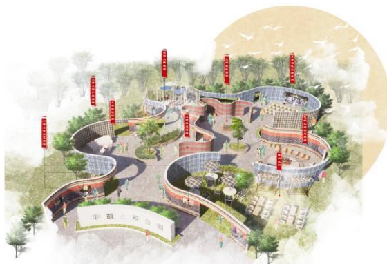
Figure. 1 Aerial view of the design of the intangible cultural heritage Tupelo Park (self-drawn by the author)