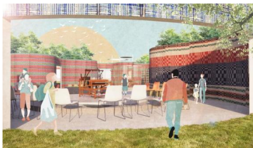
Figure. 2 Partial rendering of the intangible cultural heritage Toubou Park (self-drawn by the author)