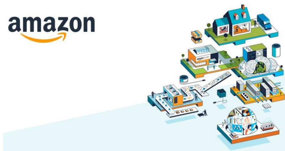
Fig. 2 An image showing Amazon ESG stocks.

Many investors in recent years have shown support for ESG investing because they want to make sure their money is going to companies that are ethical and environmentally responsible. Amazon, the world's largest online retailer and a leader in cutting-edge technology, plays an important role in this setting. According to [2], the devotion of the firm to ESG principles has garnered attention and positioned it as a viable investment alternative for those who place a high value on ethical and environmentally responsible practices. The environmental, social, and governance (ESG) performance of Amazon, one of the largest and most powerful businesses in the world, is noteworthy. Because of its size and scope, the organization possesses a once-in-a-lifetime opportunity to define industry standards and positively impact change for the better. In addition, investors are aware that companies like Amazon, which place a premium on ESG factors, have a better chance of surviving and growing over the course of a longer period of time due to the superior risk management, promotion of innovation, and creation of strong stakeholder relationships that the company possesses [3] (Fig. 2).