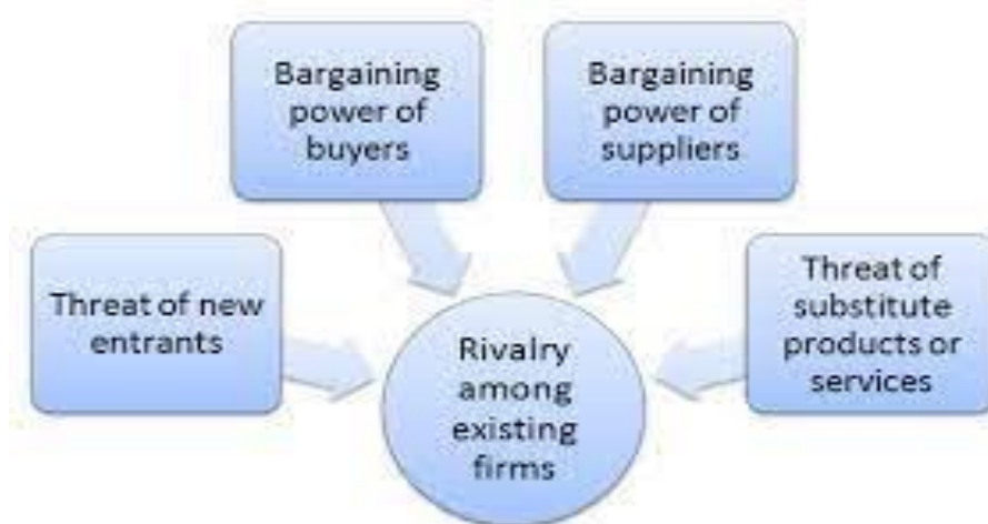
Fig. 4 An image showing the Porter's Five Forces Analysis of Amazon.

Market competition is fierce because there are so many online retailers. Amazon faces off against both well-established businesses and newer ventures. Online retailers like Walmart, Alibaba, eBay, and other specialized sites all compete with one another [12]. To maintain its market share, Amazon spends much on R&D, infrastructure, and shipping. Providing a positive and convenient experience for customers has allowed the company to remain successful. Amazon has an advantage over its competitors due to their size, efficiency, and the loyalty of their consumer base (Fig. 4).