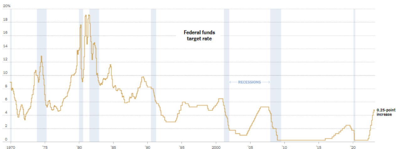
Figure 2. The Fed Raises Rates a Quarter Point and Signals More Ahead