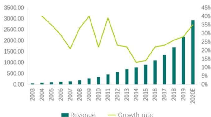
Figure 1. Revenue and growth rate of the bread industry in China

However, many small and medium-sized food enterprises in China generally have some problems, including backward production technology, lack of product quality, and narrow market size, which lead to difficulty creating brand characteristics. In market competition, to improve their economic interests, enterprises often pay more attention to production efficiency and ignore the product production process itself [2]. This unavoidably reduces the quality of the entire food processing industry. Therefore, domestic small and medium-sized food processing enterprises need to pioneer a path of innovation and break through the shackles of the industry.