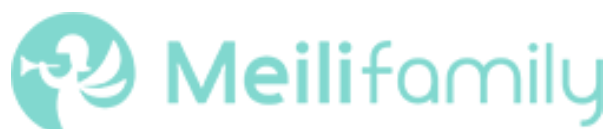
Figure 4. Logo of the Meilifamily

“Meilifamily” is the latest Family brand of Meilifamily Group. The brands have over 150 direct chain stores in Jiaxing, Huzhou, Shaoxing, Suzhou, and Taiwan. At the same time, the brand Logo with the “angel” as the main image, means that the family is committed to providing people with “safe, healthy, delicious” bakery food, striving to become the first choice of international baking brands, a brand that improves the quality of life of the nation, and the most cordial and trustworthy partner of all customers.