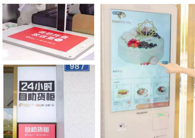
Figure 7. Self-service Equipment in the Smart Store

Meilifamily provides continuous and high-quality offline experience and service experience for consumers who need to shop in stores. Additional services are provided in stores that meet the needs of consumers, such as leisure places and drinks sales. In the era of rapid development of science and technology, Meilifamily also keeps pace with The Times. In August 2019, Meilifamily opened its first bakery Smart store in Zhejiang province. The store includes a big video game screen, a self-service cake reservation area, a 24-hour automatic container, and an AR scanning cashier. The 24-hour automatic container meets the needs of consumers who want to buy Meilifamily baked goods at night. Self-service cake reservation eliminates the complicated process of queuing for checkouts but also enables consumers to see the shape and style of the cake visually. When more consumers are queuing for manual checkout in bakery stores, consumers can choose AR scanning cashier independently, which is more convenient and fast.