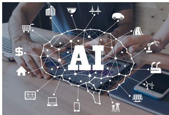
Figure 1. Application of Artificial Intelligence in different fields

Artificial intelligence technology has demonstrated a wide range of application prospects in various fields. In the field of healthcare, AI has been used in medical image diagnosis, genomics analysis, personalised treatment plan formulation, etc., greatly improving diagnostic accuracy and treatment effects. In the financial sector, AI is used in risk management, fraud detection, stock market prediction, etc., improving the operational efficiency and risk control ability of financial institutions [4]. In the manufacturing industry, AI is widely used in intelligent manufacturing, predictive maintenance, automated processes, etc., improving production efficiency and product quality. In the transport sector, AI is used in intelligent traffic management, autonomous driving technology, etc., improving the safety and efficiency of transport. In the field of education, AI is used for personalised learning, intelligent teaching aids, etc., improving the allocation of educational resources and the quality of teaching. In summary, artificial intelligence technology has penetrated into various industries and fields, bringing great impetus to social and economic development [5].