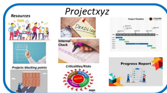
Figure 2. Project planning and scheduling

real-time data and project progress to achieve real-time monitoring and forecasting of project progress and costs, helping project managers identify problems and take measures in a timely manner, so as to better achieve project goals.