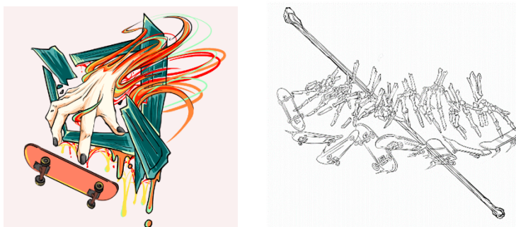
Fig 2. "Skateboarder" series illustration (the picture comes from the author's practice)

In addition to the new LOGO, the drawing and application of illustrations in clothing products are also essential. Combining street culture, the author drew a series of graffiti illustrations of "skateboarders". As well as the "Dragon and Phoenix" series illustrations that fit Chinese culture, and the illustrations are displayed on T-shirts by offset printing. The Dragon and Phoenix series of graffiti illustrations are suitable for mass customization of school teenagers, and also facilitate the distinction between men and women.