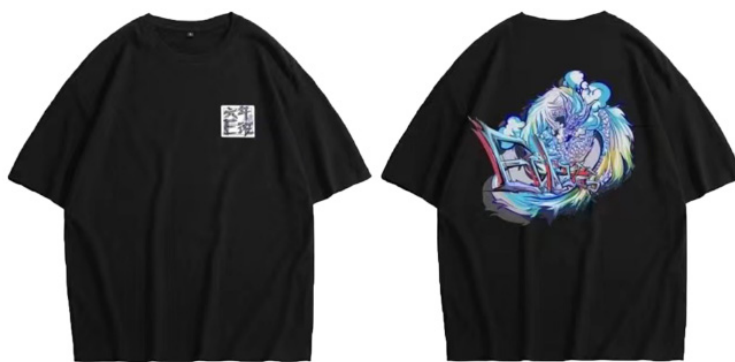
Fig 5. Effect Picture of Dragon and Phoenix Series (the picture comes from the author's practice)