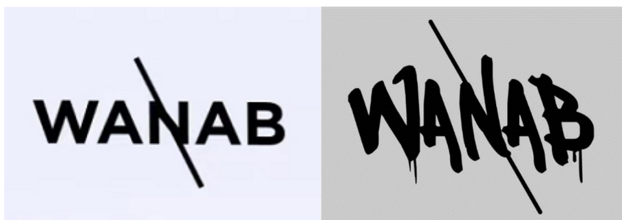
Fig 1. WANAB brand logo and graffiti style logo

The author designed a graffiti series LOGO full of graffiti characteristics according to the brand Fangyuan LOGO, and applied it to the brand's graffiti series fashion clothes.