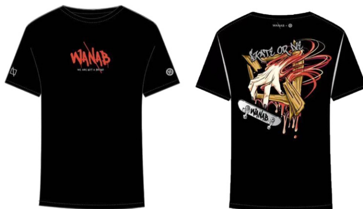
Fig 4. Effect Picture of "Skateboarder" Graffiti Series (the picture comes from the author's practice)