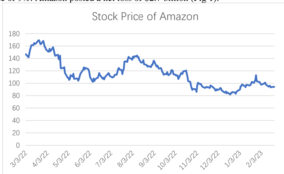
Fig. 1 Stock Price of Amazon https://finance.yahoo.com/quote/AMZN?p=AMZN&.tsrc=fin-srch

As one of the largest e-commerce companies in the world, the shares of Amazon have been strong. As of February 28th, 2023, Amazon's stock price is $93.76 per share. Amazon stock has performed well over the past year, with shares up about 35.53% in the third quarter. But the company's performance is not very good, with net sales reaching approximately $514 billion in 2022, a year-on-year increase of 9%. Amazon posted a net loss of $2.7 billion (Fig 1).