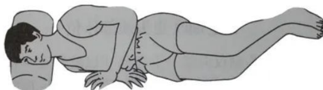
Fig. 4 Presentation of Side lying position

2.Side lying position: In the side lying position, the legs are bent, the body is bent, and the whole body is in a relaxed state, which is conducive to relieving fatigue. It is a relatively comfortable sleeping position. Generally, the right recumbent position is more healthy and will not oppress the heart and reduce the heart burden. For obese people, especially those with central obesity, the horizontal position is not suitable, and the lateral position can be selected, which is beneficial to keep breathing smooth while sleeping. In addition, sleeping on the left side of the pregnant woman in the late pregnancy is beneficial to relieve the pressure of the abdomen on the lumbar spine, improve the sense of comfort, and reduce the pressure of the uterus on the artery, which is beneficial to the blood supply of the placenta. Sleeping on the side of the baby can also prevent vomiting and reflux of stomach contents.