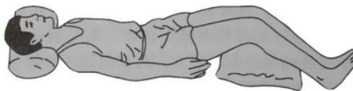
Fig. 3 Presentation of horizontal position

2.Side lying position: In the side lying position, the legs are bent, the body is bent, and the whole body is in a relaxed state, which is conducive to relieving fatigue. It is a relatively comfortable sleeping position. Generally, the right recumbent position is more healthy and will not oppress the heart and reduce the heart burden. For obese people, especially those with central obesity, the horizontal position is not suitable, and the lateral position can be selected, which is beneficial to keep breathing smooth while sleeping. In addition, sleeping on the left side of the pregnant woman in the late pregnancy is beneficial to relieve the pressure of the abdomen on the lumbar spine, improve the sense of comfort, and reduce the pressure of the uterus on the artery, which is beneficial to the blood supply of the placenta. Sleeping on the side of the baby can also prevent vomiting and reflux of stomach contents.