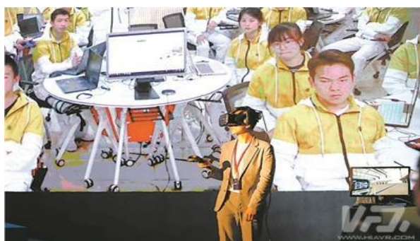
Figure 5 VR use in class

In order to create a thorough comprehension of the pertinent course material and enhance personal comprehensive quality, you should have a tailored experience. However, using VR technology allows students to experience the significance of epidemic prevention and control, encouraging them to take part in these efforts. (Fig. 6)