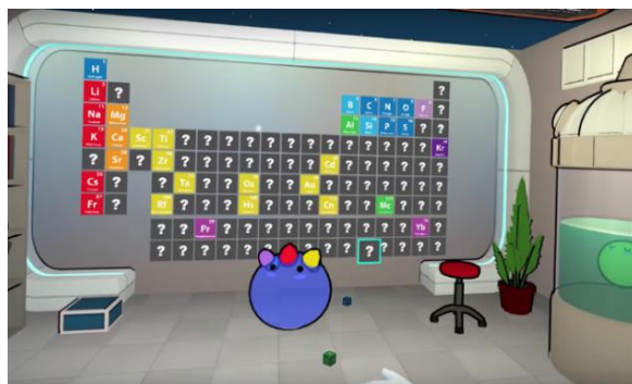
Figure 1 VR chemistry game “Tablecraft” makes learning periodic table fun.

VR education is a way that trying to make teaching and learning an easy-going game, such as VR, AR technology for cigarettes Support, instead of learning step by step boringly, interactive games achieve physical and mental and cognitive together for the purpose of the learning services and improve the students' learning efficiency. Embodied cognition theory encourages students' feeling during classes. Many fields such as AI, psychology, and ethics apply this theory and proved it's a possible educational method. Specific cognitive is put forward for further development in the field of VR education game provides a strong theoretical support, makes the education game design should not only consider how to embed the education cognition content certain game background, the environment, the game play, and the rules of the game, and to consider how to achieve the perfect naturally physical movement and body of students. From the previous examples and other VR education application all around the world. If we can improve the physical body of the students, VR education will be even more efficient (Fig.1).