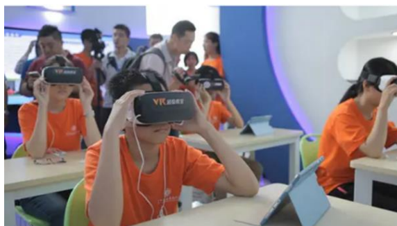
Figure 2 VR headset promoted students to study.