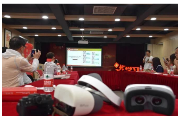
Figure 6 VR in political lecture

In order to create a thorough comprehension of the pertinent course material and enhance personal comprehensive quality, you should have a tailored experience. However, using VR technology allows students to experience the significance of epidemic prevention and control, encouraging them to take part in these efforts. (Fig. 6)