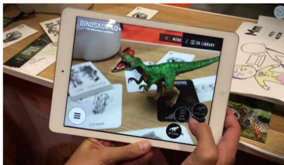
Figure 3 Augmented Reality apps for education provided by Digital Trends.

Augmented reality-based educational games have different types named by their characteristic. Such as character storytelling, physical position based virtual world, and mission-based games [9]. Augmented reality technology now is mostly separatable from camera equipment because AR needs camera to make augmented videos based on it [10]. When analysing educational games based on augmented reality, this paper will analyse the different emphases emphasized in game design. The comparison for VR education and traditional education as shown in Table 1.