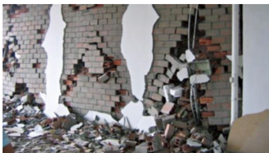
Figure 1. The collapse of an infilled wall during earthquakes

Although the wall made of the masonry built with burned clay bricks is one of the most common types of construction frame structures for its low cost. These walls could easily break with inclined fissures and the fissures can continue crazing around columns. After the attack of earthquakes, the damage near headwalls, the walls between windows and the corners of doors and windows become worse than the original situation. If the intensity of the earthquake is hard enough, these walls with fissures are going to collapse (Figure 1). Besides, the lateral deformation caused by shear force may cause the deformation in the lower part of a structure to be bigger than the higher part, this makes the lower part of the infilled wall heavier than the higher part when the earthquake happens. Due to the low shear strength of the infilled wall, the ability to defect the damage caused by deformation is poor. There is no effective tie effect between walls and structures, shear broken is easily happened after the reciprocating deformation during the earthquake [6].