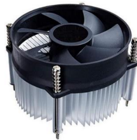
Figure 1. A sketch of heat sink [15].

The increasing usage of electronic components demands a more efficient cooling system, rather than conventional poor performance methods of water and air cooling. To develop appropriate methods of cooling, it is crucial to ensure that the cooling fluid has good thermal conductivity and low viscosity since extra energy is required to pump the fluid when the viscosity is high. Heat transfer engines can be designed according to two technologies called passive cooling and active cooling. Passive cooling involves utilizing heat transfer phenomena such as conduction, convection, and radiation to transfer heat to surroundings. Examples of passive cooling include heat sinks, which is made up of thermal conducting metals with fin-like structure. The heat from the CPU is first transferred to the metal and finally dissipated into the air. This method is energy-free despite the fact that it requires more material when the CPU generates more heat. Another cooling system is called an active cooling system, the cooling liquid may be pumped to cool the CPU and then be cooled by fans. The cooled fluid is then pumped back to the cool CPU. Though electricity is required to drive the system to work, this technique is more efficient in heat transfer.