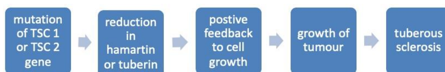
Figure 2. TSC 1 or TSC 2 mutation

sclerosis develop ASD. This condition is caused by mutations in either the TSC1 or TSC2 genes located on chromosome nine. Any mutation in these genes can lead to abnormal development of body cells. TSC1 produces a protein called hamartin, while TSC2 produces a protein called tuberin. Both proteins act as tumour suppressors within cells, regulating cell growth through the mammalian target of rapamycin (mTOR) pathway and serving as negative feedback mechanisms. Mutations in the TSC1 or TSC2 gene result in reduced levels of hamartin or tuberin, leading to the growth of tumours. Neurobiological investigations have shown that abnormalities in the frontal and temporal regions of the brain can affect individuals and potentially contribute to the development of autism [13]. Tuberin, the protein produced by the TSC2 gene, is highly expressed in these brain areas. The presence of tubers (abnormal growths) in the temporal lobe, frontal lobe, posterior tuber, or cerebellum can lead to intellectual disabilities, seizures, and autism [14]. These generalized disruptions in brain function account for about 50% of individuals with tuberous sclerosis complex exhibiting autism as one of their symptoms. (as depicted in Figure 2).