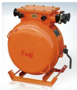
Fig. 1 Mine explosion-proof reversible vacuum electromagnetic starter