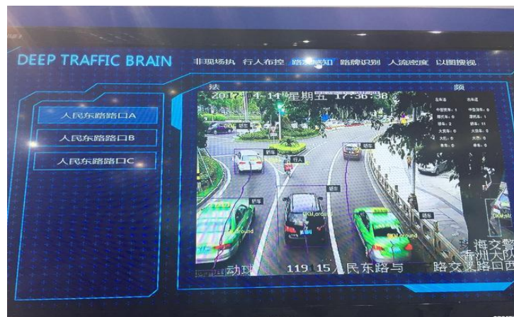
Figure 2. Yuantong intelligent transportation system [10]

Yuantong intelligent transportation system was launched by “Xi Yue” (A private enterprise focused on the construction of smart cities). Like this application, it has functions such as understanding pedestrian control, road condition perception, calculating pedestrian density, and recognizing road signs. This intelligent transportation system can be seen in Figure 2.