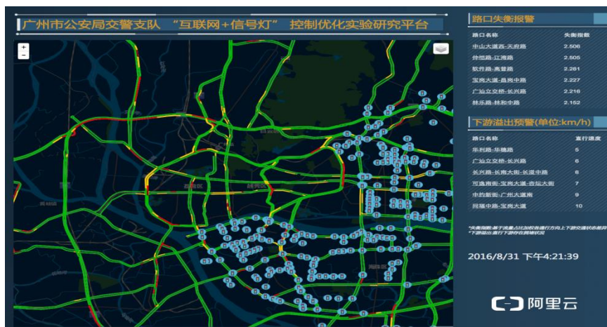
Figure 3. Guangzhou Internet plus signal light control optimization experimental research platform [11]

Systems that include AI bring the idea of outcome-oriented learning to applications that were traditionally static. When a system is capable of learning from both its successes and failures, and consistently adjusting algorithm parameters to achieve improved results, it can become more flexible and generate greater advantages. A control optimization experimental research platform can be seen in Figure 3.