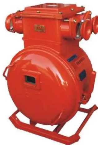
Figure 3. Mine explosion-proof electromagnetic starter