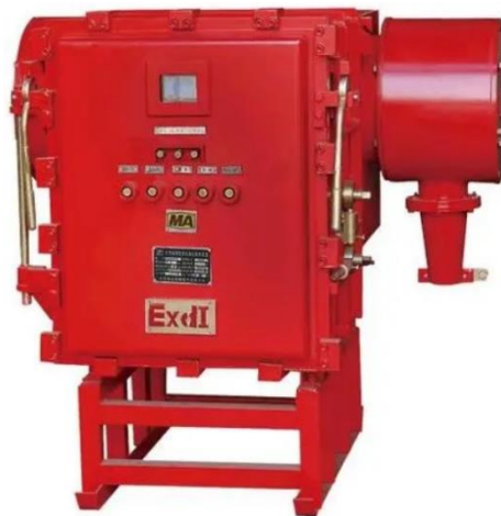
Figure 2. Mine explosion-proof high-voltage distribution device

Coal mine explosion-proof electrical equipment refers to electrical equipment used in the underground power distribution system, mining system, transportation system, safety protection system, and rescue system in coal mines. Coal mine explosion-proof electrical equipment mainly includes mine explosion-proof high-voltage distribution devices (as shown in Figure 2), mine explosion-proof low-voltage feeder switches, mine explosion-proof control boxes, mine explosion-proof electromagnetic starters (as shown in Figure 3), and other products. Coal mine explosion-proof electrical equipment plays a dual role in controlling and protecting safety in underground production. It is suitable for use in explosive environments containing gas, dust, and other hazardous substances and is classified as Class I explosion-proof equipment. The thick and heavy explosion-proof housing of coal mine explosion-proof electrical equipment prevents internal explosion flames from spreading to the external environment and ensures that the equipment is not affected by external explosions. However, the thick and tight structure is not conducive to heat dissipation, which leads to the temperature of explosion-proof electrical equipment being much higher than that of similar electrical equipment on the ground.