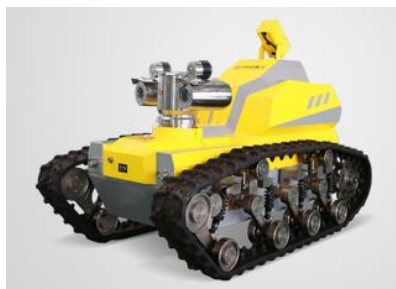
Figure 2. Mining tracked firefighting reconnaissance robot

With the development of intelligent technology in coal mines, mining robots, mine inspection instruments, and trackless rubber-tyred vehicles are increasingly being used as carriers for intelligent mining in underground coal mines. Mining robots are machines that can rely on self-power and autonomous control to perform specific mining functions. They can assist or replace human mining operations or operate in hazardous positions through command, pre-programming, and artificial intelligence planning. Broadly, the connotation of coal mine robots is rich, and according to different underground operation areas and functional positioning, coal mine robots can be divided into five categories, including excavation, coal mining, transportation, safety control, and rescue. Trackless rubber-tyred vehicles are suitable for auxiliary transportation operations in underground coal mines, mainly used to transport general auxiliary materials, small equipment, and for engineering construction in mine galleries and underground road surfaces. Trackless rubber-tyred vehicles are composed of explosion-proof engine devices, exhaust explosion-proof systems, mechanical transmission systems, hydraulic systems, electric start (or air start), electric protection systems, and explosion-proof electrical systems.