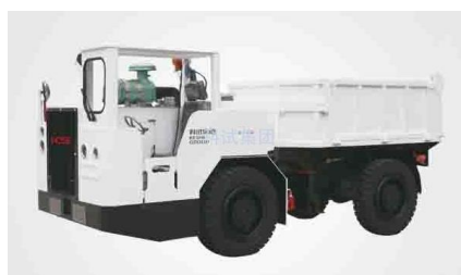
Figure 3. Explosion-proof diesel engine trackless rubber wheel vehicle