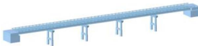
Figure 1. Schematic diagram of the three-dimensional structure of the bridge

Classify the bridge according to the unit and line location of the bridge, directly click the bridge structure to be viewed on the map interface, and click to enter the three-dimensional structure diagram of the bridge (see Figure 1). In order to determine the position of the sensor more accurately, the arrangement of each monitoring point can also generate a three-dimensional structure diagram, as shown in Figure 2.