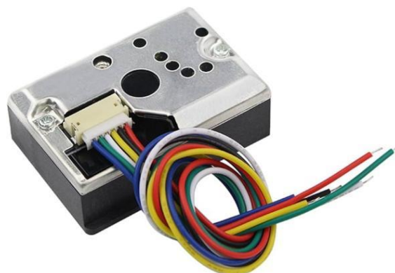
Fig 2. GP2Y1014AU0F powered dust sensor [6].

Figure 2 showed the GP2Y1014AU0F powered dust sensor, and GP2Y1014AU0F is a low-cost optical mass sensor. The infrared light emitting diode and phototransistor inside the sensor enable it to detect dust reflected light [7]. The measuring range of GP2Y1014AU0F was shown in the Table 2.