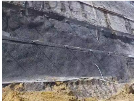
Figure 2. Example 1 of Slope Support in Foundation Pit Engineering [5]