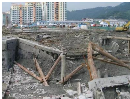
Figure 1. Example 2 of harm caused by improper support [1]

If proper slope treatment measures can't be selected or used irregularly, the slope soil will creep and deform, which will lead to cracks and water seepage in the sewer, and water will soak into the slope soil, which will lead to slope instability; The balance of support is broken, and cracks appear at the top of the slope, which makes the slope treatment ineffective. Foundation pit collapse is a common final consequence caused by poor selection of treatment measures for foundation pit slope, and it will also destroy the nearby buildings. If the foundation pit collapse is not warned before, the foundation pit collapse may cause life harm to the foundation pit and people near it (Figure 1).