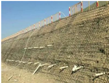
Figure 3. Example 2 of Slope Support in Foundation Pit Engineering [6]