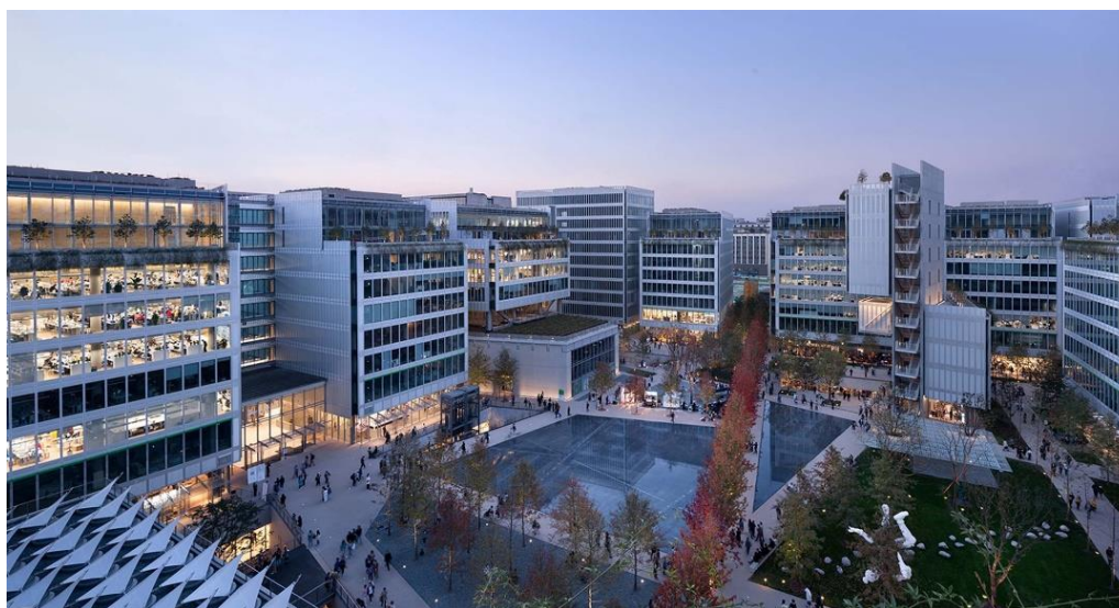
Fig 2. OōEli Art Park [19].

However, as an independent area in the city, public open spaces have both large open spaces and high pedestrian density. If public open spaces are combined with the street vendor economy, the above problems can be well solved. OōEli Art Park in Hangzhou, China, is a good example (Figure 2). As an atypical commercial complex, OōEli Art Park is surrounded by 17 individual buildings. The central square is used to operate street stalls. The existence of street vendors extends the indoor commercial space to the outdoor, not only expanding the original commercial space, but also providing vitality for the street vendor economy. On weekends, the square will hold a market event. Here, some cheap and unique small items will be sold. Therefore, it can not only attract young people to come and consume, but also perfectly solve the issues of space management in the street vendor economy.