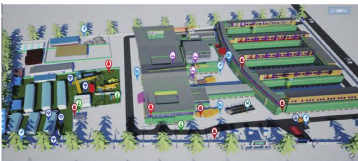
Fig 2. Smart Construction Site Location Planning Map [10].

Smart construction site platform: Integrate BIM, Internet of Things, cloud computing and other technologies to achieve digital, online and intelligent management of the construction site. As shown in Fig. 2, on-site information, on-site personnel, mechanical equipment, production process, tower cranes monitoring, and other on-site information can be easily obtained through smart construction site platform [10].