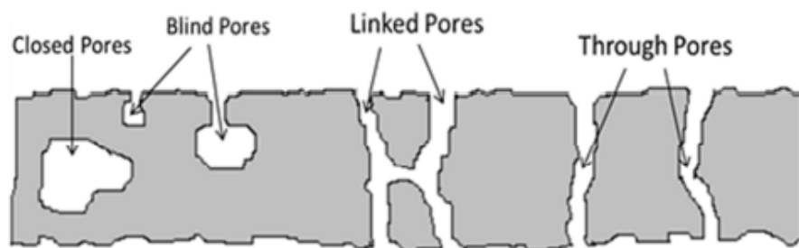
Fig. 2 Typical sketch of different kinds of pores.

Since the adsorption capacity of shale is determined by things (e.g., pore structure). Therefore, one did a molecular simulation of methane adsorption using the Monte Carlo method, and it is wanted to see the effect of pressure and temperature on adsorption. The results show that the adsorption capacity decreases with the increase of temperature and increases with the increase of pressure [12, 13]. The typical structures of pores and snapshots of the structure are illustrated in Fig. 2 and Fig. 3.