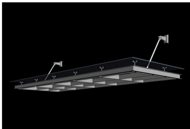
Figure 1. Diagram of steel structure tilt-rod canopy