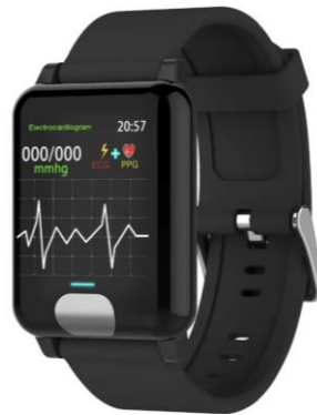
Figure 1. Smart watch monitoring heartbeat

Wearable bioelectronics are sophisticated devices that are worn on the body in order that the integrated electrical components could interact with the biological systems to track, diagnose, and possibly treat medical conditions. The flexibility and the comfort of wearable technology are combined with the accuracy and functionality of bioelectronics. Different types of sensors including electrical, mechanical, optical ones are normally worn on the skin of human body to detect the signals [4]. By trapping and analyzing biological fluids secreted on the surface of the skin, the sensors measure and monitor the activity inside the human body through saliva, sweat, and tears [5]. The data collected by the sensors are then processed by the microprocessors, located inside the whole sensor. First filtering some noise and unnecessary data, the microprocessor then starts to analyze and tries to interpret the data. This is followed by the matching process between the data collected and the database to see that whether the person's heartbeat or body temperature is abnormal or not. After carrying out these algorithms in the processors, if some unpredicted data was detected, it would then transmit the signal to other devices through network so that the person or the doctor could know what is wrong with the person and offer corresponding solutions. An example could be found in a smart watch in Fig.1 where the watch could monitor the heartbeat of the owner.