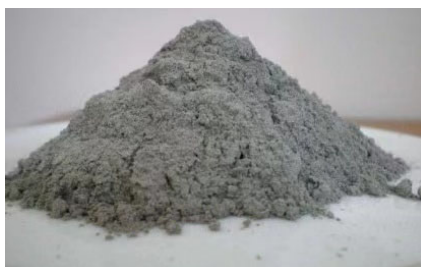
Figure 1. Common fly ash concrete

With the gradual development and in-depth study of technical personnel in the field of materials, now, alkali-activated concrete is located at the summit of the technology of cement replacement, which means alkali-activated materials would replace the traditional cement binder completely. At present, two kinds of Fly Ash-based materials with low calcium are hot research topics: (1) alkali-activated fly ash concrete (AAFAC) (2) slag/FA-based geopolymers concrete (Figure 2). For both types, in the construction stage, it is possible to obtain sufficient mechanical properties. The internal interface structure of concrete can be improved by adding fly ash to reduce the porosity and increase the compactness of concrete. Moreover, replacing part of cement with fly ash in hydraulic concrete can save the amount of cement and effectively utilize local industrial waste [2,3,10]. At the same time, it can reduce environmental pollution and engineering cost and has the dual role of saving energy and protecting the environment.