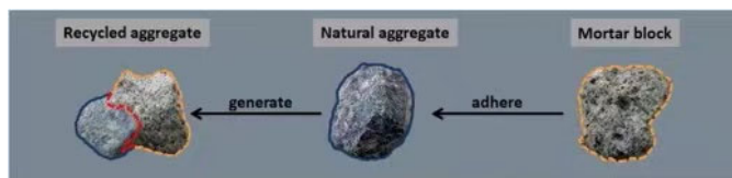
Figure 4. Principle of recycled aggregates concrete

Previous research and test have shown that the behaviors of structural elements made by analyzed concrete types under short-period loading are very similar to the corresponding NAC. Shear capacity of the beams made of NAC_FA, NAC_AAFA, RAC and RAC_FA are quite similar to the corresponding NAC beams [7,8]. In terms of seismic behaviors, the conclusion is equally valid.