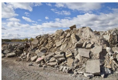
Figure 3. Recycled aggregates

The tensile strength of recycled concrete is also closely related to the original waste concrete, which is generally about 18 % lower than that of natural aggregate concrete [4,17]. The tensile strength of recycled aggregate concrete also increases with age, but remains unchanged after 28 d. To further improve recycled concrete's tensile strength, an appropriate water reducer and fine silica fume can be added to the mixing process, and the improvement effect is the most obvious after 28 days.