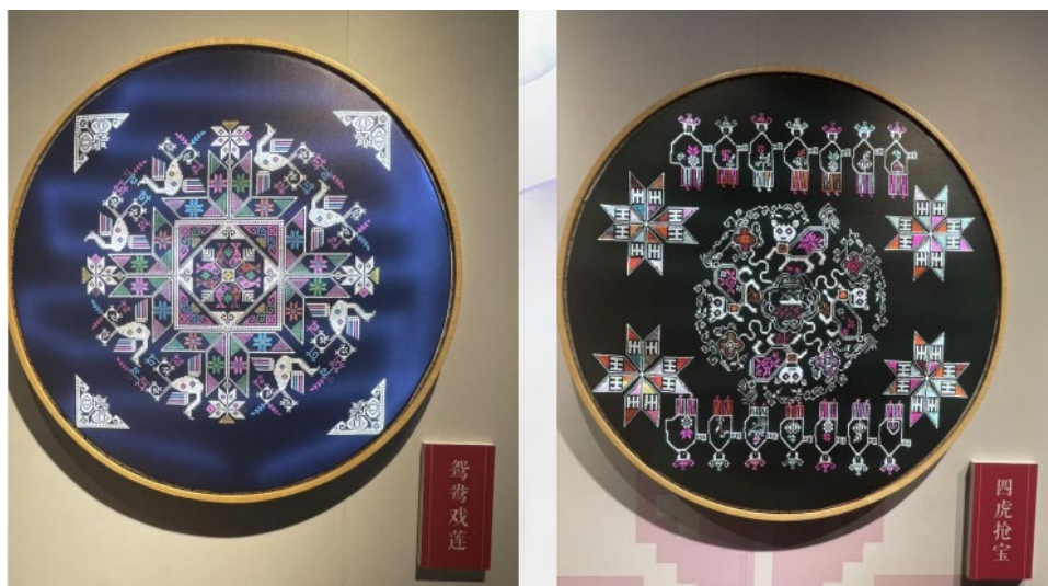
Fig 2.

Romanticism is the characteristic of Chu culture. Huangmei cross-stitch has a strong romantic color since ancient times. Chu's strong witch wind, Chu's beautiful scenery lit the heart of the romantic fire of Chu, Chu art bold make public, frank and bright is its endless fuel. The colorful yellow-plum cross-stitch is rich in color and has high color brightness. It usually has a dark color as the base, a white line as the bone, and a red line as the main line. It is decorated with yellow or orange lines of the same color, or contrasted with cool blue or purple lines. Pay attention to the use position of auxiliary color and area, collocation overall feeling to build color. The color matching principle of main and secondary, strong and light makes the picture harmonious and lively, colourful but not vulgar, and brings the viewer rich visual perception.