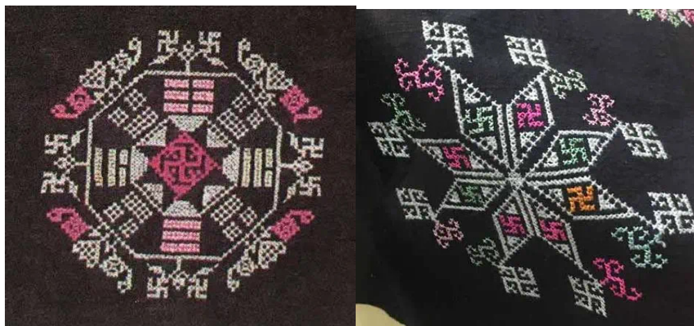
Fig 1. Image from the Internet

"Picture must be intentional, meaning must be auspicious" is a major feature of traditional Chinese decorative patterns. Although the working people have been living in poverty for a long time in the course of history, they have never given up their yearning for a better life. They put interesting memories in daily life and hope for a better future in cross-stitch art works, praying for their villagers and future generations with pure and kind hearts. The implication of Huangmei cross-stitch pattern mainly includes: the function of carrying culture and the symbol of life message.