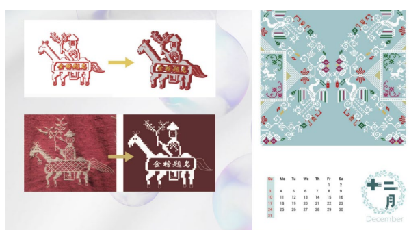
Fig 4. Image from the Internet

The innovative drawing techniques include the combination of the currently popular Mosaic art technique, cyberpunk art style and traditional Huangmei cross-stitch. The Mosaic style modeling features are combined with the strong colors of cyberpunk, and the traditional themes and patterns are retained in the collision between modernity and tradition. The modern drawing techniques make Huangmei cross-stitch closer to the modern aesthetic characteristics. The primitive patterns and auspicious meanings inject new vitality into the traditional art with modern drawing methods and style characteristics.