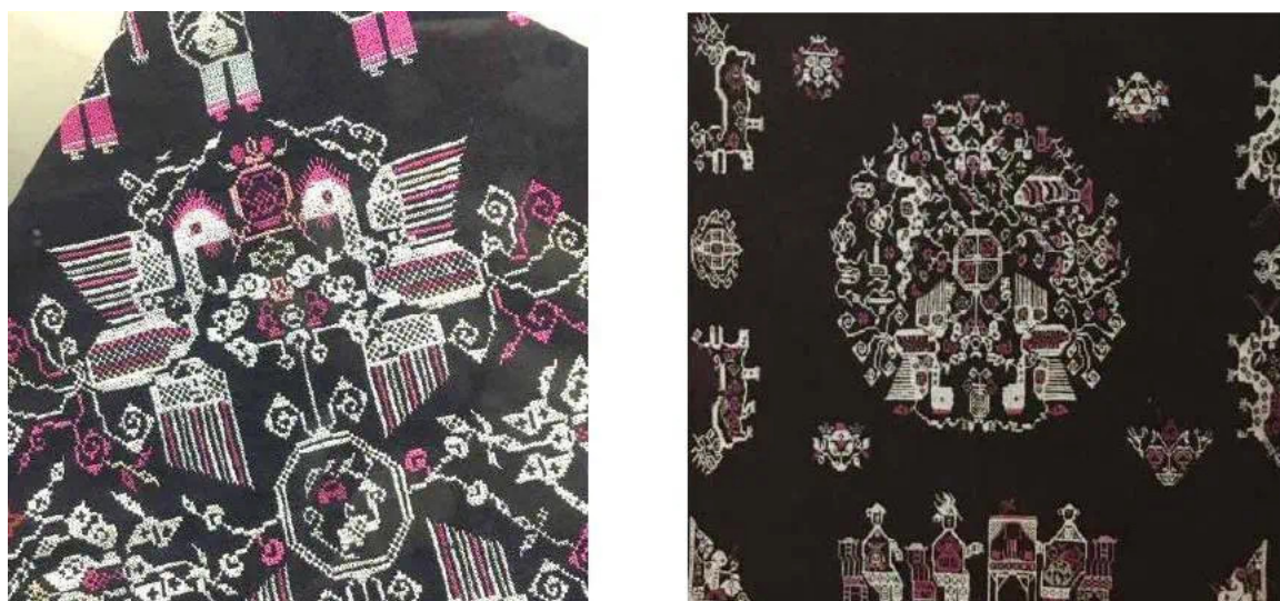
Fig 3. Image from the Internet

symmetrical. The features of Huangmei cross-stitch design are exquisite details and honest images. For example, the tiger pattern in "Tiger Pillow" has clean lines, lively, lovely and full of vitality, and the surrounding plant patterns are simple and simple, which are harmonious and unified with the text. No matter rectangular composition or circular composition, no matter single object composition or narrative scatter composition, symmetry is inseparable from the word. Except center spends around four consecutives, like "sunrise" red phoenix in morning even center sees the up and down or so in all directions pattern is different, but the occupied area, put the position are almost equal, the most important thing is the edge Angle of flowers around the Angle in the direction of the positive center, even if the grain appearance for different, still very harmonious neatly in a glance, This is the unique charm of Huangmei cross-stitch.