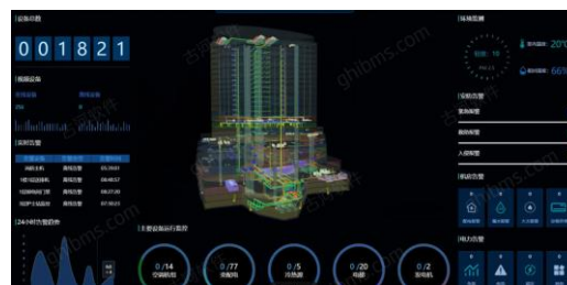
Figure 5. BIM operation and maintenance management system