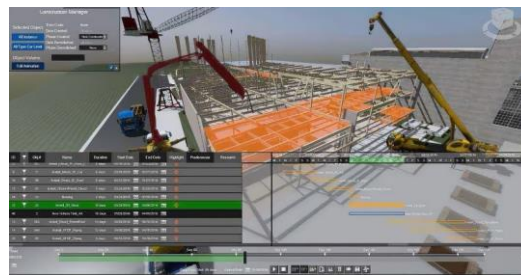
Figure 4. BIM construction progress simulation

In addition, the BIM model can also be combined with the construction schedule to truly simulate the daily engineering progress, observe the progress intuitively, and control the construction period, as shown in Figure 4.