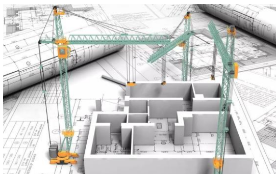
Figure 7. Using BIM technology to build a site model

Using BIM technology can use its own characteristics to assist designers to build a site model to show the most realistic state of the construction site in an all-round way, and it is convenient for construction personnel to view the site. Through pre-recorded data, such as elevation data and slope data, whether there are cracks in the structure It is convenient to adjust the direction according to the data, and handle every detail more scientifically.