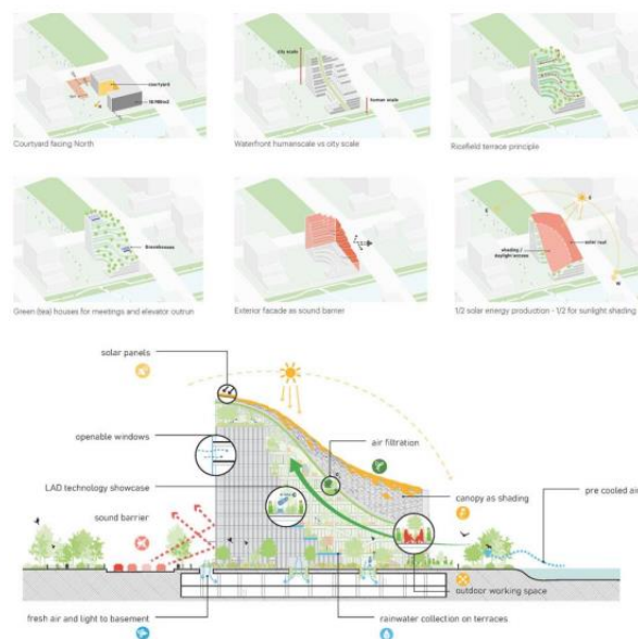
Figure 8. Lighting Analysis

The southern roof of the LAD headquarters is clad with solar panels, while the northern roof is hollowed out to allow sunlight and rain to reach the terrace below. On the facade of the building, solar panels and glass are folded and arranged.