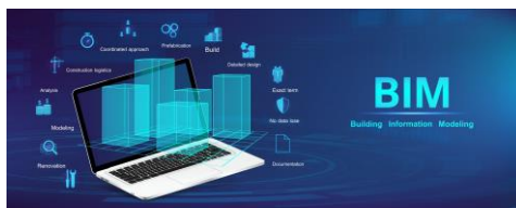
Figure 1. BIM technology

BIM technology is a digital tool used in the design of engineering drawings, engineering construction, and engineering management. It is the main construction information management mode based on computer information technology. Project users can accurately grasp construction data through cloud computing, thereby reducing unnecessary construction and operation costs. And through the 6D correlation database, including sound, light, air, water flow, heat, etc., to provide management data to support engineering projects, and to provide building services according to local conditions to meet the needs of users.