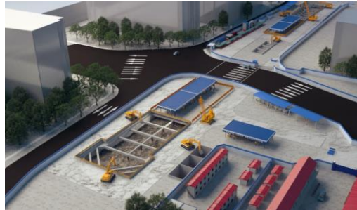
Figure 3. BIM construction process simulation

In addition, the BIM model can also be combined with the construction schedule to truly simulate the daily engineering progress, observe the progress intuitively, and control the construction period, as shown in Figure 4.