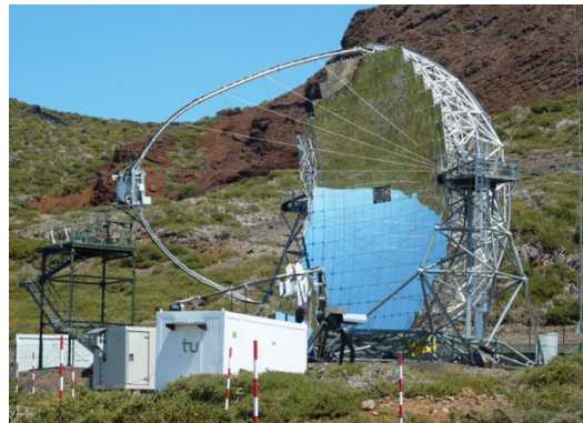
Figure 2 The first MAGIC telescope locating at the Roque de los Muchachos Observatory [11].

Indirect detection focuses on the products caused by such self-annihilation or decay of dark matter particles in the outer space, including high-energy gamma rays, positive and negative electrons, protons and antiprotons, neutrons, neutrinos, and various cosmic ray nucleons.