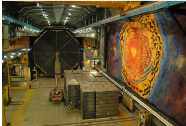
Figure 1 MINOS neutrino detector is a laboratory expanded by the University and the Minnesota Department of Natural Resources to accommodate physics projects [8].

Consequently, if one of these particles collides a nucleus of the matter in the detector, then the detector is able to observe the change in the nucleus's energy. Based on analysing the process of the collision, the properties of dark matter can be found. Most of detection apparatus are build underground to minimize the interference from cosmic rays to guarantee the efficiency of experimenting. As shown in Fig.1, underground laboratories such as MINOS detector are widely used to do direct detection of the dark matter.