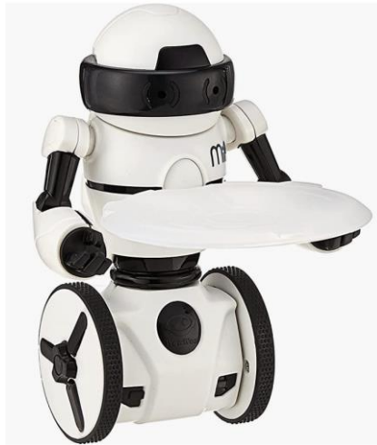
Fig 2. Balancing robot [3].

hazardous materials transportation in various fields such as military, archaeology, and scientific research, etc. Also, under different programming, two-wheeled self-balancing robots can be used as educational and service robots (figure 3).