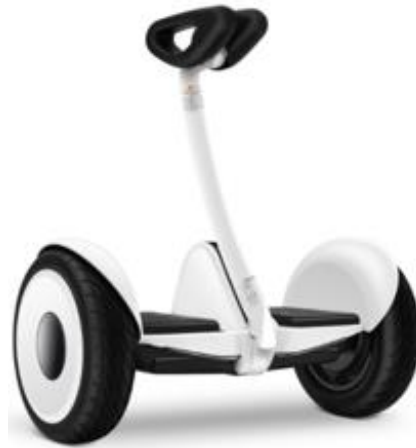
Fig 4. Different types of balance cars: walking type [2].