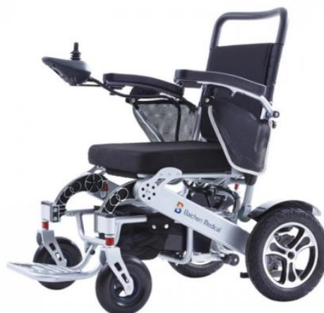
Fig 6. Balanced wheelchair [7].

As a new application of balance robotics, the field of automatic obstacle avoidance wheelchair research contains a wide range of technical support, including vision, haptic sensing, machine control, human-machine interaction, pattern recognition and so on. Research on self-balancing wheelchair technology first began in 1986, when the wheelchair was assisted by vision for navigation. Then came the technology of placing the seat on a mobile robot platform and using human manipulation and infrared sensing for recognition and control. After decades of development, researchers around the world have developed a variety of functional self-balancing wheelchairs, including breakthrough research by WheelEasy and others at MIT in the United States. In short, there is still great room for the development of self-balancing wheelchairs in heavy multiple directions such as human-computer interaction, which makes the prospect of wheelchair discovery become even broader (figure 6).