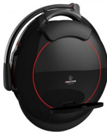
Fig 5. Different types of balance cars: portable [3].