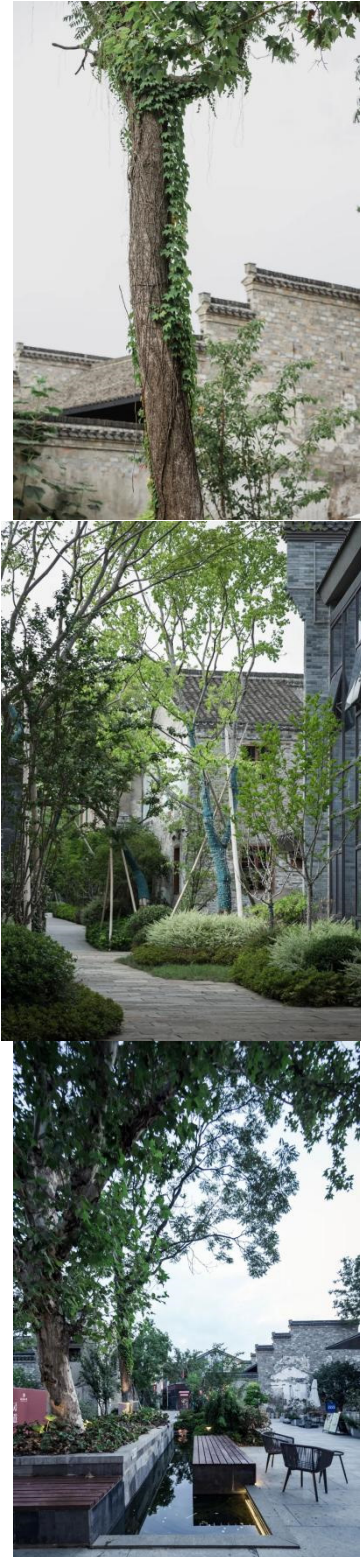
Fig 3. Preserved old trees on the original site