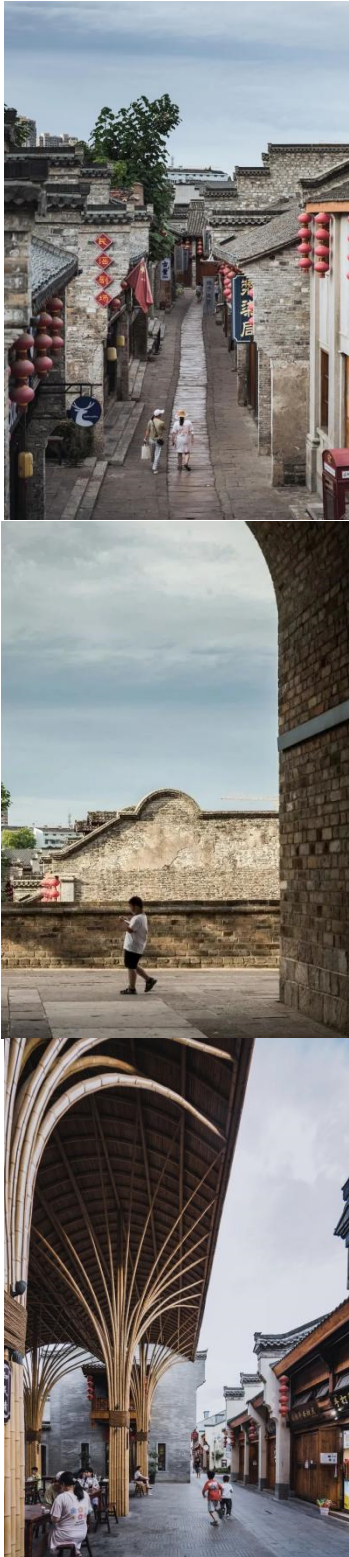
Fig 2. Restored streets and scenes of life