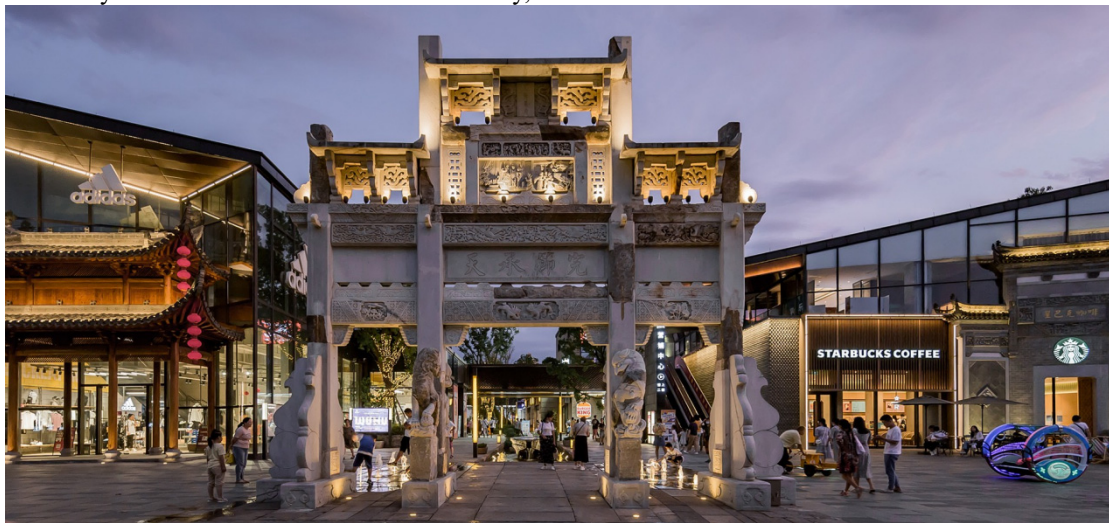
Fig 1. Laifeng Gate, Wuhu Ancient City

Wuhu Ancient City is situated in the center of Wuhu City,