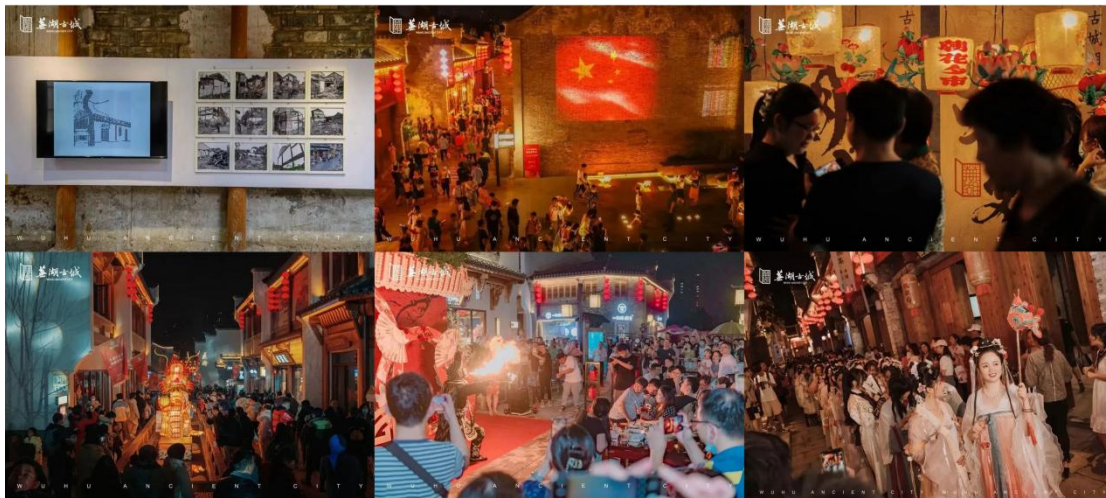
Fig 5. Events held after the renovation, such as seminars, light festivals, national style bazaars, Mid-Autumn Gala, Lantern Festival, etc.

urban landscape design strategies. It draws on research and analysis of urban landscapes based on cultural heritage protection at home and abroad. The strategy is exemplified by a case study of Wuhu Ancient City in Wuhu City, Anhui Province. The objective is to provide experience and reference for urban landscape design work.