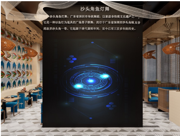
Figure 4. The rendering of the AI interactive device at the entrance of this design

In the design of dining spaces, attention should be paid to the combination of tradition and modernity, avoiding blindly pursuing tradition. With the development of modern technology, the innovation of Shatoujiao fish lantern dance elements should be combined with intelligent interaction to further explore the expression of traditional culture in high-tech environments. Modern technology can be used to express traditional connotations, and AI interactive devices can be used to unlock the intrinsic culture of the Shatoujiao Fish Lantern Dance.