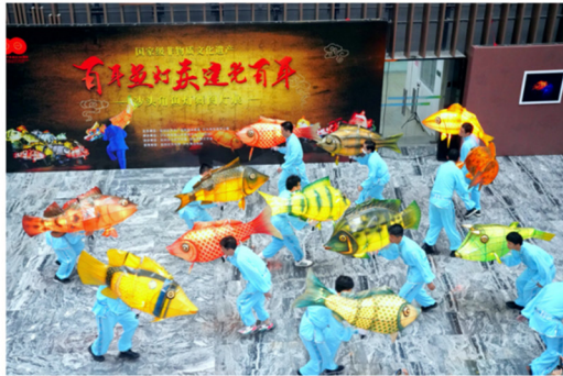
Figure 2. Color Extraction Diagram

The illuminance, color temperature, and brightness of lighting affect the atmosphere of the dining space. In design, the lighting methods for the entire space are divided into indirect lighting, direct lighting, effect lighting, and accent lighting. Decorative lights with high color temperature hanging on the ceiling are used for ambient lighting, making the entire viewing space have no dark corners. Hanging a low color temperature chandelier above the desktop is used to emphasize lighting, improve the color rendering of the object, and increase customers' appetite. In the design of diversified lighting methods, it is also necessary to clarify the contrast and primary secondary relationship of light and dark in the lighting space. The area with the highest brightness is not necessarily the focus of lighting design. The focus of lighting should be displayed through the concentrated use of multiple lighting methods to render the atmosphere of the space [6]