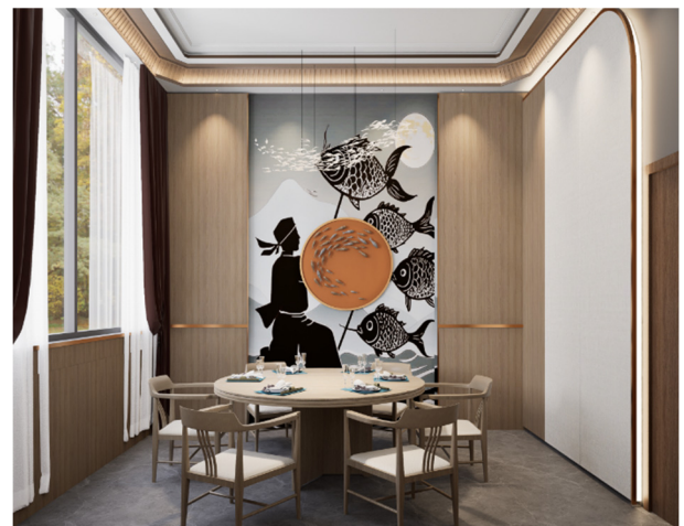
Figure 3. The rendering of the private room in this design

The dining cabinet, storage cabinet, and partition cabinet are made of light yellow wood, which echoes the ceiling and reflects the overall style unity. The booth partition is made of dark metal fish scale material, adding a modern element to the cultural atmosphere. The partition between the booth and the loose seat is simplified with acrylic fish light dance image decoration, and the built-in light strip in the exhibition cabinet enhances the artistic expression of the environment.