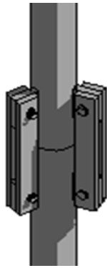
Figure 1. Steel bar ear plate connection