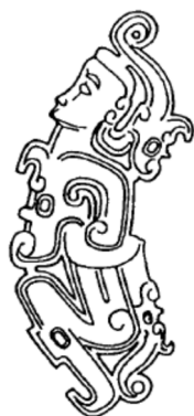
Figure 3. Jade figure with Composite dragon pattern

combination of dragon and tiger patterns, or other. The human-shaped jade tablets in the jade wares of the Marquis of Jin Dynasty are mainly a combination of dragon patterns and human figure patterns.