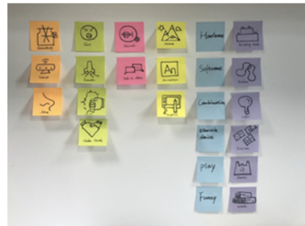
Figure 3. Function

As a design tool with strong participation, the engagement tool can play a role in breaking ice and explaining and explaining in interviews. We can also make the questions we want to ask the interviewee into small card games and other forms, allowing interviewers to participate in the interview more interestingly, making the whole process more vivid.