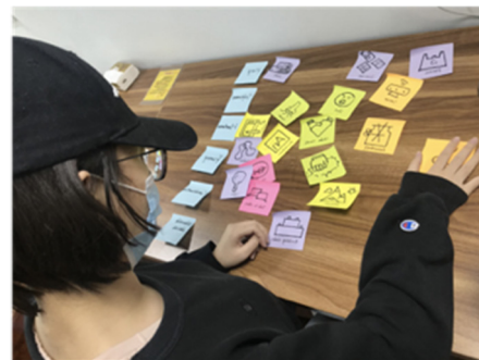
Figure 4. Testing