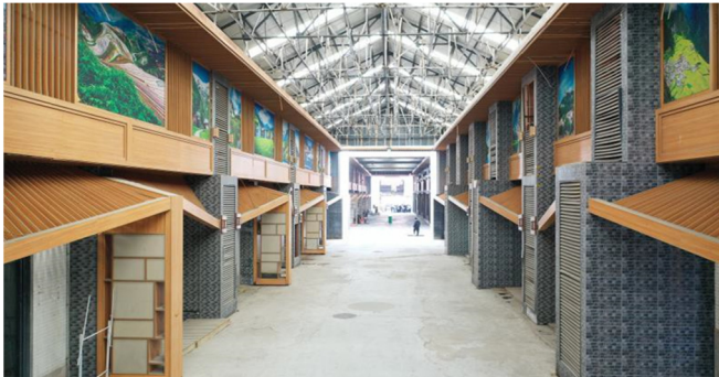
Figure 1. Internal structure of Gutianfang workshop

inevitably produce industrial pollutants. In modern factories, polluted gases or polluted water sources can be properly treated and discharged or reused through scientific treatment methods. In the production environment of that year, environmental issues were insignificant in front of production efficiency, not to mention the integration of buildings with the surrounding environment during design and construction. These remaining problems are placed in the present, making a large number of industrial heritage buildings extremely mismatched with the surrounding environment of the site without transformation, and unable to form a natural ecological urban building complex. The limitations of the times when the building was constructed also led to the lack of ecological features of the building.