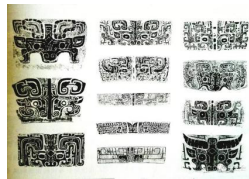
Figure 3. Animal Face Patterns

Thunder pattern is the most basic geometric pattern of bronze, various forms of thunder pattern are different geometric combinations, but also the most basic structure of bronze pattern. [7]