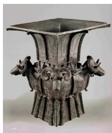
Figure 5. Bronze Square Zun Decorated with Four Rams

The "middle way" originated from Confucianism and Mencius, which is a kind of social interaction law and life philosophy based on the feudal patriarchal order, and is also reflected in art aesthetics. In decorative patterns, we can see that the expression of the "middle way" is mainly reflected in directional and symmetrical shapes or patterns. According to W.H.J. Schoenmakers, a modern abstract theorist, "The material world consists of two structures, vertical and horizontal." Bronze patterns of the Xia, Shang and Zhou periods, such as the animal face pattern, followed certain rules and guidelines, that is, the horizontal or vertical line as the central axis, unfolding on the plane. This "median idea" pursues accuracy, extending and unfolding at a single point, which can be located anywhere between the two ends, either in the center or between the two ends. In ritual activities, the ornament of the main body on the front is usually oriented to the public and placed towards the front. The main body decoration is divided into front and side. For example, the "Bronze Square Zun Decorated with Four Rams" of the Shang Dynasty, a relic excavated in Changsha, Hunan Province, is symmetrical from side to side with the head of a sheep as the center. This type of decoration makes it possible to see a complete image of a sheep's head from the front, and extends the symmetrical axis to the sides, presenting a "sheep's head-shaped" representation.