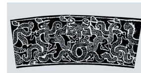
Figure 2. Scroll Dragon Pattern