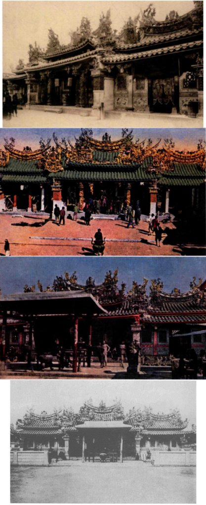
Figure 2. Beigang Chaotian Temple (top left: 1914-1915 [23]; top right: 1907-1918; bottom left: 1918.3-1933.2 [24]; bottom right: 1926 [25])