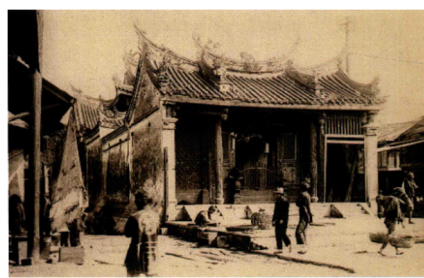
Figure 1. Tainan Narcissus Temple (1907-1918) [22]

The literature records the artistic effects of the roof decorations and overall themes of temples in Taiwan during the Kangxi period of the Qing Dynasty, but the specific craftsmanship methods are unknown. Based on the historical images of temple roof decorations in the late Qing Dynasty in the southern Fujian, Taiwan, and Southeast Asia regions, the basic characteristics of the "Southern Fujian style" architectural roof decorations can be traced back to the late Qing Dynasty. "Image evidence is more direct and specific compared to textual evidence, but it is limited by technical conditions, such as insufficient clarity and the inability to record colors."