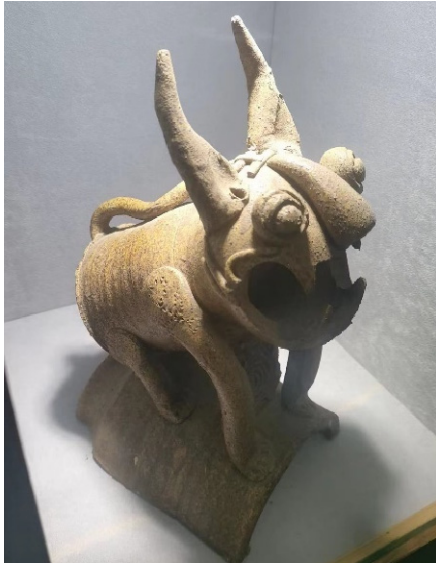
Figure 1. Yi Nationality tile-cat