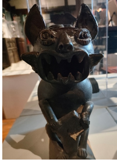
Figure 2. Han Nationality tile-cat

The author took a selfie at the Tile-cat Museum, 2023.12