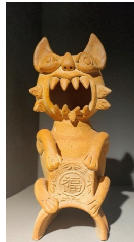
Figure 4. Fu characters tile-cat