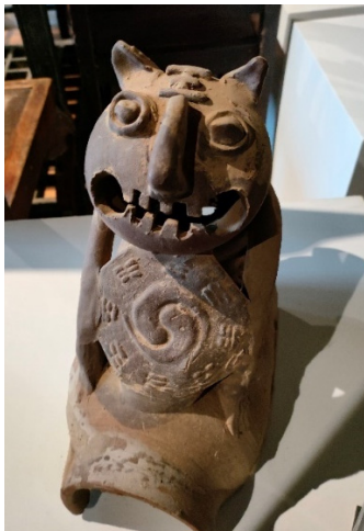
Figure 3. Eight Trigrams Array tile-cat

The author took a selfie at the Tile-cat Museum, 2023.12