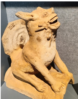
Figure 5. Tile-cat 1