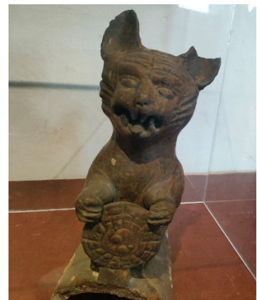
Figure 7. Tile-cat 3