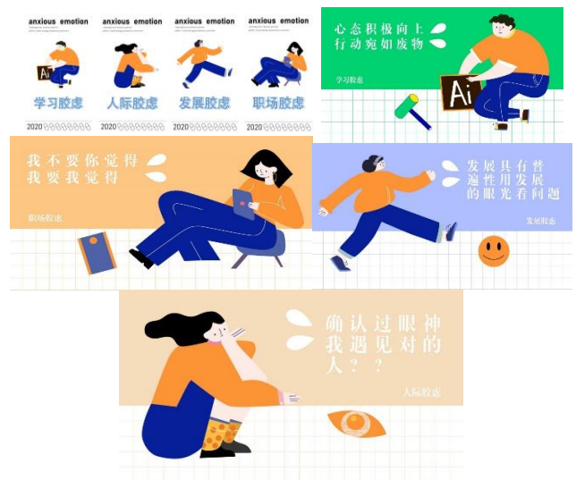
Figure 4. "Gum Anxiety"