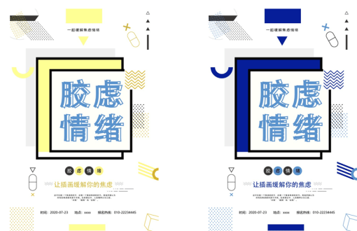
Figure 5. "Gum Anxiety"