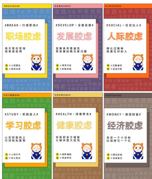
Figure 3. "Capsule Ma"

In the design process, the author uses IP characters (shown in Figure 3), a series of illustrations and posters to present. (As shown in Figure 4) The author depicts the anxiety and stress faced by some people in their lives and explains the corresponding solutions. In the graphic language, the composition: The author adopts a rectangular frame and uses the capsule as the creative inspiration to design the character of the capsule, and applies the IP image to the illustration series. In addition, in these illustrations, the author composes from the first perspective, goes through the text to elaborate the inner activities of the characters when they are anxious, and wants to express emotions in the form of inner monologue. In the author's series of illustrations and posters, (as shown in Figure 5) the author combines dots, lines and surfaces to form a picture, using a flat painting technique to express the anxiety of the characters in the picture through different forms of illustration and forming a series. For example, workplace anxiety, economic anxiety, developmental anxiety, interpersonal anxiety, learning anxiety and health anxiety. The author uses orange and blue as the main colors, intending to convey a positive attitude to people through the colors and calling on the audience to overcome anxiety together (as shown in Figure 4).