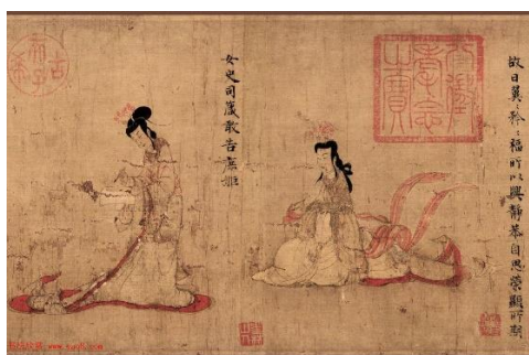
Figure 2. <The Lady of History>