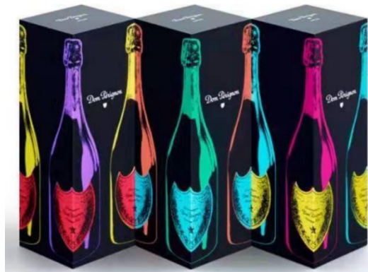
Fig 2. Tang Pei Li Nong Launches Commemorative Bottles

For example, in the beverage packaging design in Figure 2, the simple element of the beverage bottle is used to express the volume by using the structural relationship in sketching. Unlike simple sketching, the color rendering treatment is carried out here, and on the black background, high saturated colors of yellow, purple, blue, orange and pink are used to highlight the characteristics of the product. The simple and ordinary beverage bottle elements are repeatedly shown several times, and the beautiful colors are used to distinguish the different flavors of different beverages in the packaging. The overall simplicity but not monotonous and passionate is the effect of Pop Art in the packaging design.