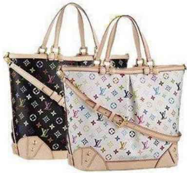
Fig 1. LV three color series handbag