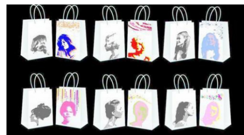
Fig 3. Packaging Design of Paper Bag

One of the great characteristics of Pop Art in design applications is its repetitive use of simple surfaces with bold and striking colors, often using contrasting colors to create a sense of visual difference. The elements it uses are usually not overly complex, often consisting of a few simple geometric lines, abandoning the inherent aesthetic impressions, complicated artistic configurations and a variety of delicate structural treatments, just simple shapes can take away the hearts of the people, without the need for too complex emotions.